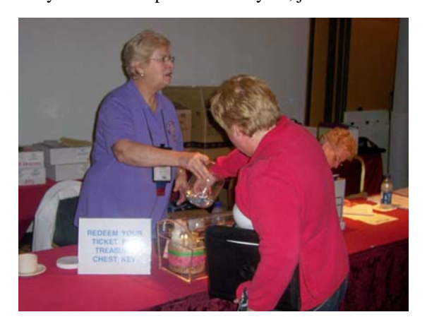
Photo Below: Clerks who attended the Clerks Conference in Atlantic City were given the opportunity to win a special prize, just for registering! The Clerks Conference mixes fun, education and camaraderie—all vital components of a successful career. If you weren't a part of it this year, join us in 2009!