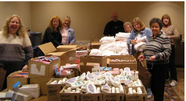
Above Left: Meet and Greet at the MCANJ Conference Above Right: Hard Work went into Preparation for the MCANJ Conference. Great Job everyone!!!