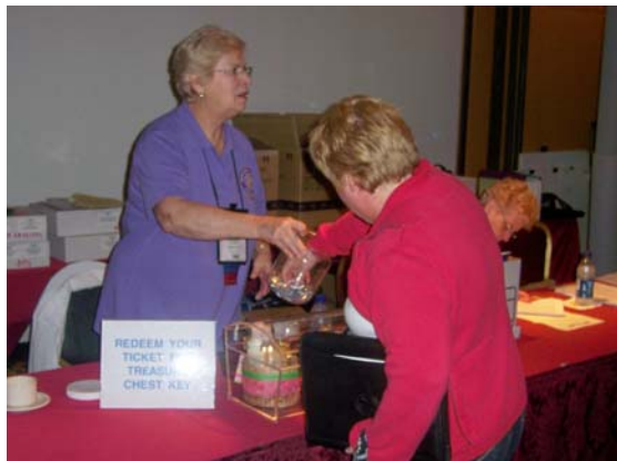
Photo Below: Clerks who attended the Clerks Conference in Atlantic City were given the opportunity to win a special prize, just for registering! The Clerks Conference mixes fun, education and camaraderie—all vital components of a successful career. If you weren't a part of it this year, join us in 2009!