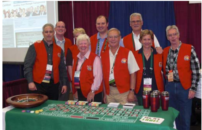
A full contingent of NJ Municipal Clerks lent helping hands at the New Jersey Table, promoting the 2013 IIMC conference which will be held in Atlantic City.