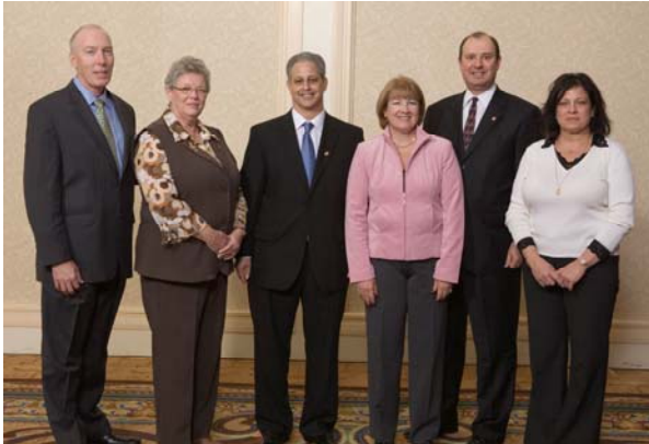
THE 2010 MCANJ EXECUTIVE BOARD

Another prevalent issue that I plan on focusing during my term has to do with our tenure. In this very volatile environment that has become local government, it is even more important that we have protection against unwarranted removal from office. Total disregard of the tenure provision that governs our profession cannot and will not be tolerated. Over the past few years, attempts to remove tenured Municipal Clerks have become a major concern for this Board and should be for the entire Association. As I stated before, our predecessors fought to get the legislation passed, and we cannot let that go by the wayside. We need to get some teeth into the law and we will. You have my commitment.