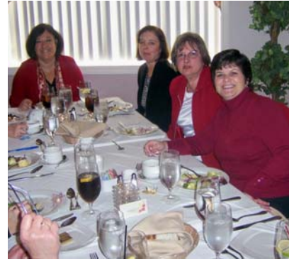
The Sussex County Municipal Clerks Association Celebrated their Annual Christmas Luncheon on December 4, 2009 at Casa Bellissima in Andover, NJ